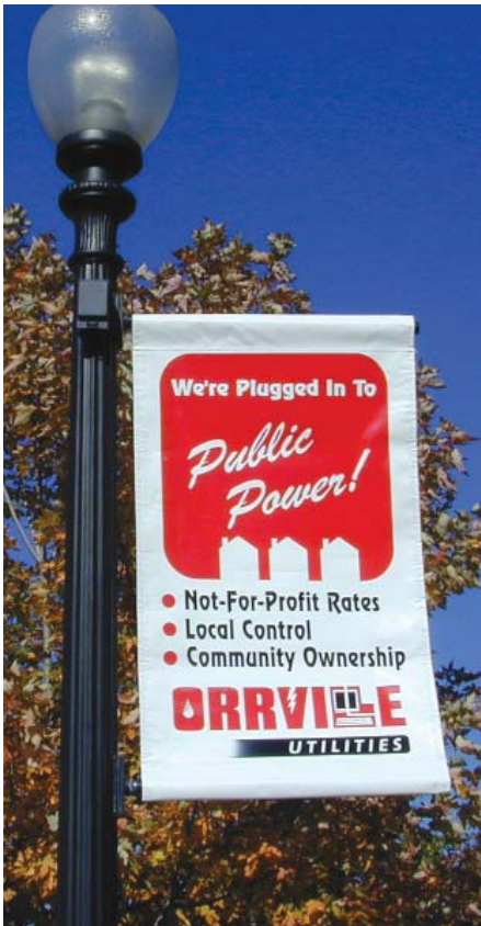
Orrville Utilities Street Banner