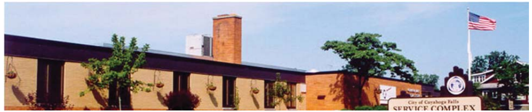
Cuyahoga Falls Service Complex

Funding Request: $30 million Approved Funding: $30 million bridge loan Total Project Investment: $3,074,000,000