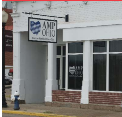
AMP-Ohio Meigs County Office