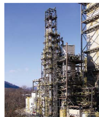
Powerspan Burger Deployment

AMP-Ohio is the non-profit wholesale power supplier and services provider for municipal electric systems in six states. The Ohio-based organization was formed in 1971 for the purpose of owning and operating electric facilities, or providing for the generation, transmission and distribution of electric power and energy to its member municipal electric systems. AMP-Ohio meets its obligations today by coordinating, negotiating and developing power supply options and interconnection agreements. AMP-Ohio owns the 213-megawatt coal-fired Richard H. Gorsuch Generating Station near Marietta Ohio, and operates the 42-MW Belleville Hydroelectric Project on the Ohio River, the 7.2-MW AMP-Ohio Wind Farm near Bowling Green, and 138 MW of distributed generation for its member systems. Membership in AMP-Ohio currently stands at 127, including: 81 public power communities in Ohio, 29 in Pennsylvania, seven in Michigan, five in Virginia, three in Kentucky and two in West Virginia. The organization is currently in the developmental phase of significant investment in new generation resources, including more than 350 MW of new hydroelectric generation, in addition to newer, more efficient coal generation.